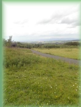
View across the Forth