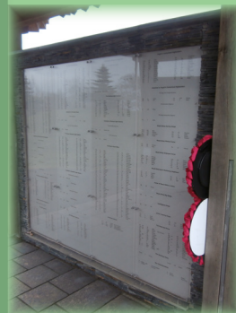
Names of the war dead