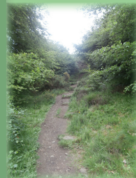
Steps to the Wall