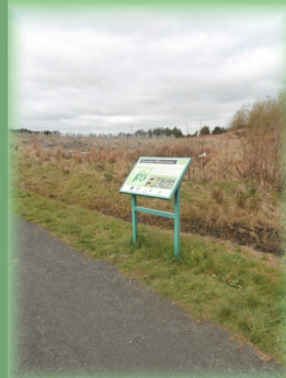
Map and information board