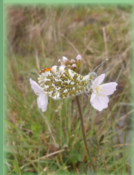
Orange Tip Butterfly