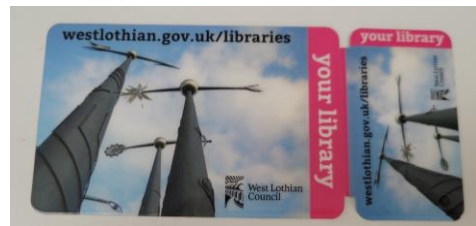
Adult Library Card

I will sign a form, this makes me a member of the library and I will be given a library card. If I am over 18 years old I will be given the card titled "Adult Library Card".