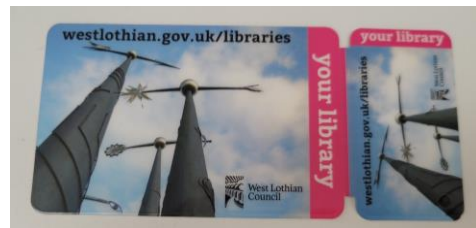
Adult Library Card

I will sign a form, this makes me a member of the library and I will be given a library card. If I am over 18 years old I will be given the card titled "Adult Library Card".