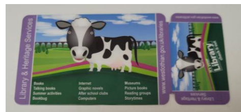
Child Library Card