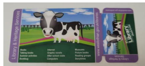
Child Library Card