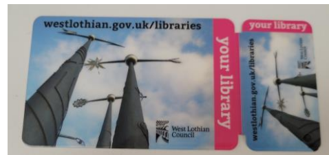
Adult Library Card