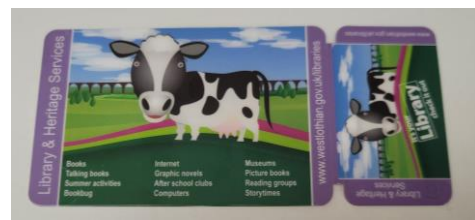
Child Library Card