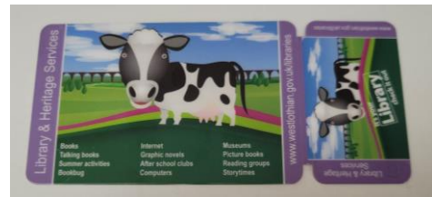
Child Library Card