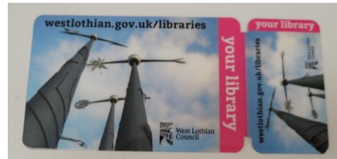
Adult Library Card

If I am a child I will be given a card with cows on it.