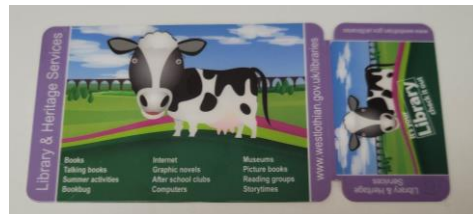
Child Library Card