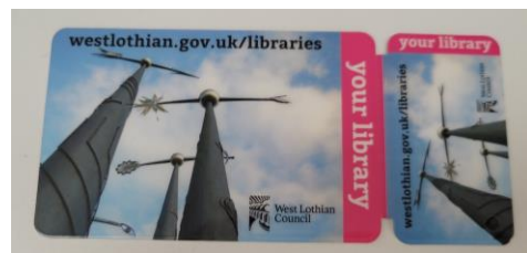
Adult Library Card

If I am a child I will be given a card with cows on it.