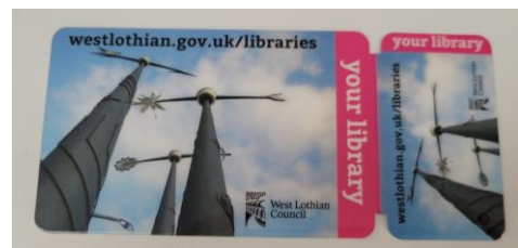
Adult Library Card

If I am a child I will be given a card with cows on it.