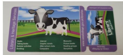
Child Library Card