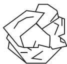
Used kitchen roll and tissues