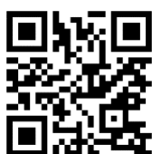
Pet Fostering Scotland

The current council's policy is that we cannot accept pets into any temporary accommodation. You will need to explore alternative options such as speaking to a friend or family member to take them in while you are in temporary accommodation or look into pet fostering. Below are QR codes to the Hope Project through Dogs Trust and also Pet Service Fostering Scotland.