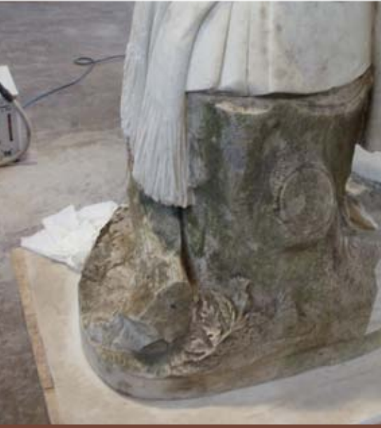
Detail of thistle can just be seen