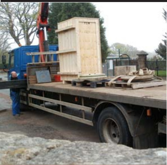
The statue is all set for the first leg of the journey. A Visit to the Workshop of Graciela Ainsworth