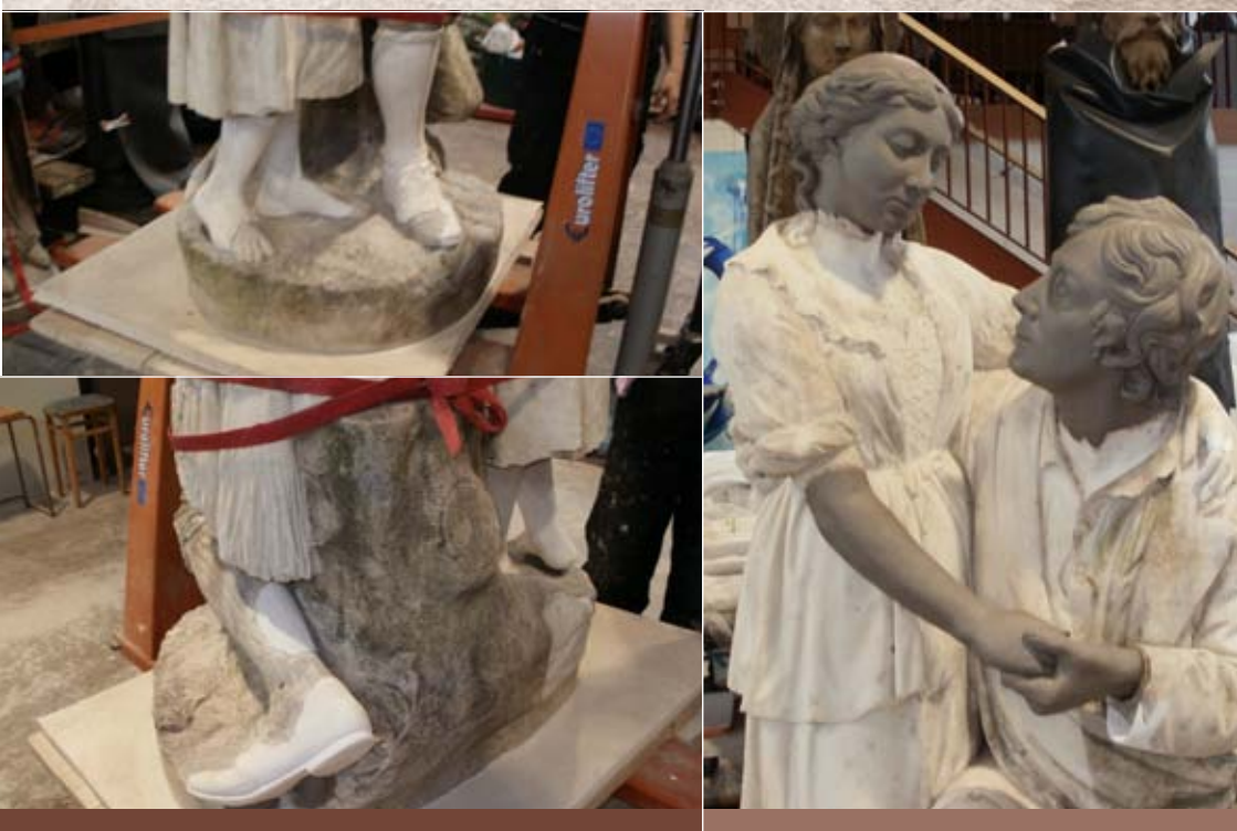
Modelling of the legs