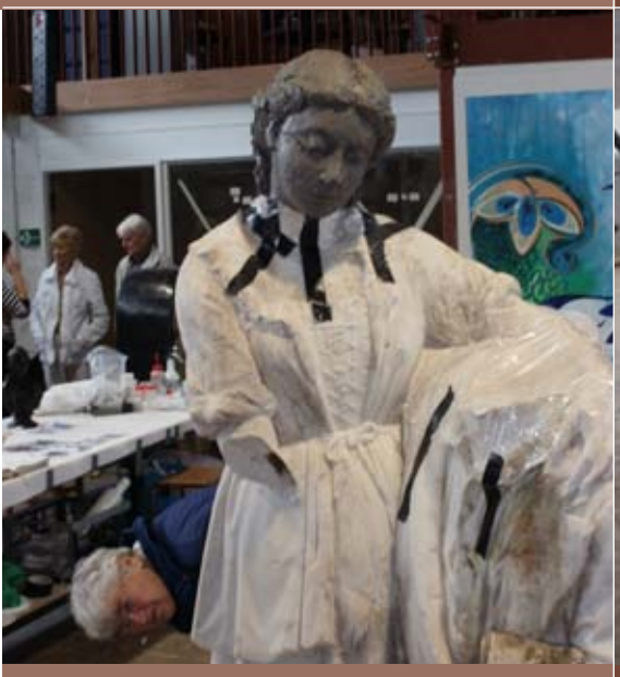
Modelling of the new head for Highland Mary