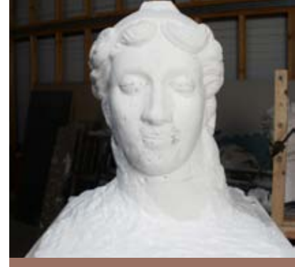
Mary's head being sculpted in marble

The thumb prints of the Society were added to the resin section of Burns' heel at the back of the sculpture. The delight about this is clearly seen in the photograph where we are posing like five "Little Jack Horners".