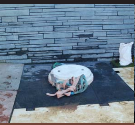
The Base is measured and laid

reassembling the plinth and then carefully placing each piece of marble in position with a layer of lime mortar. The morning winter sun gave that special luminosity to the white marble and we were much impressed.