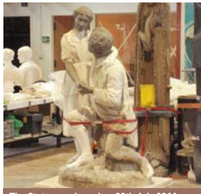
The Statue as viewed on 28th July 2011 on the second visit to Graciela's Workshop

On 28th July 2011 a second visit was paid to Graciela's Workshop. Things had moved on apace and although Graciela reported the marble was still not available. The original source was to be Italy but an increase in costs was proving horrendously expensive and the finest white marble, "Thassos" from Greece was selected. The statue looked impressive. The missing limbs and heads had been expertly reproduced, modelled in clay/resin, and were in place.