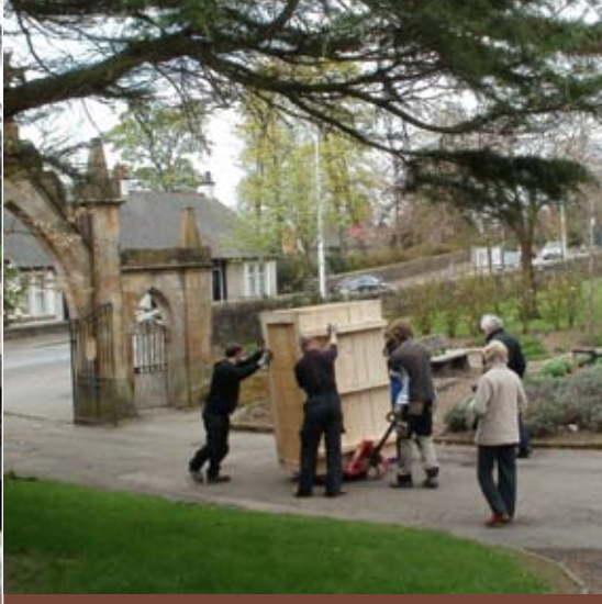
Heading for the Stewart Gates