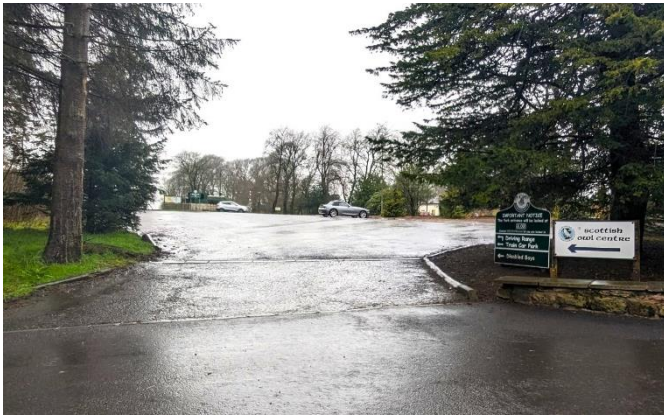
Train car park