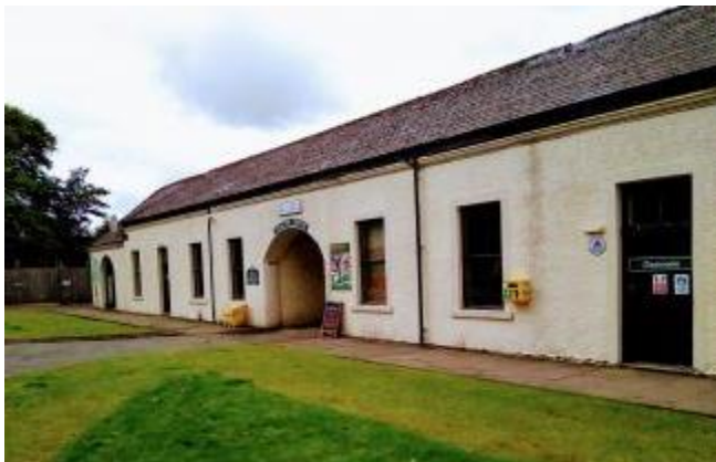
Entrance archway to the Visitor Centre