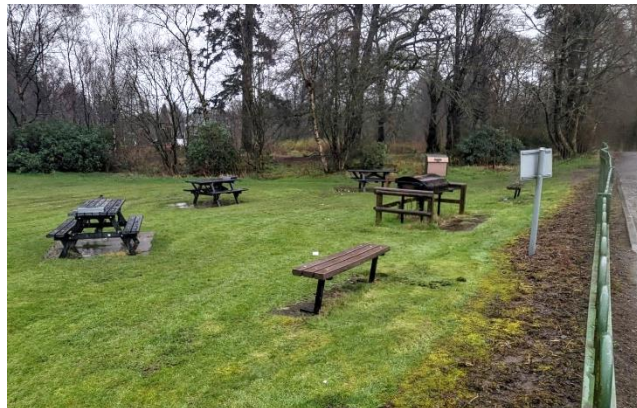
BBQ Area with tables near the Play Area