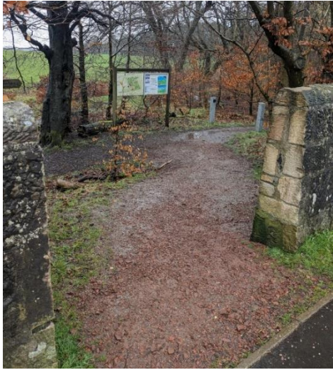
Greenrigg pedestrian entrance