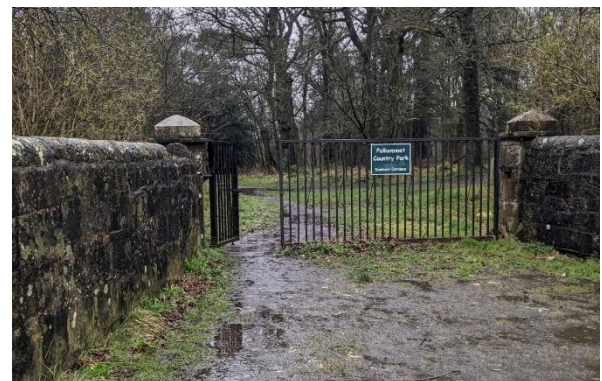
Dumback pedestrian entrance