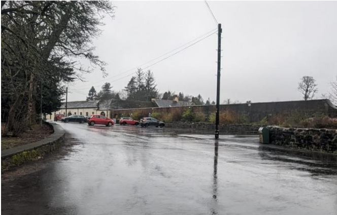
Golf car park