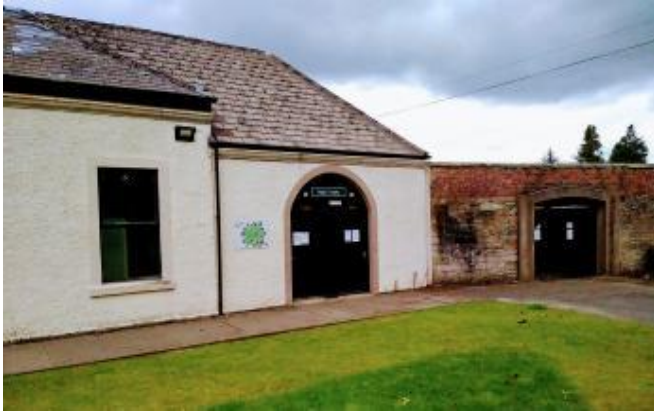
Entrance to public toilets