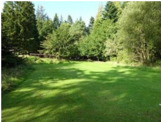
Grass picnic area near the Play Area