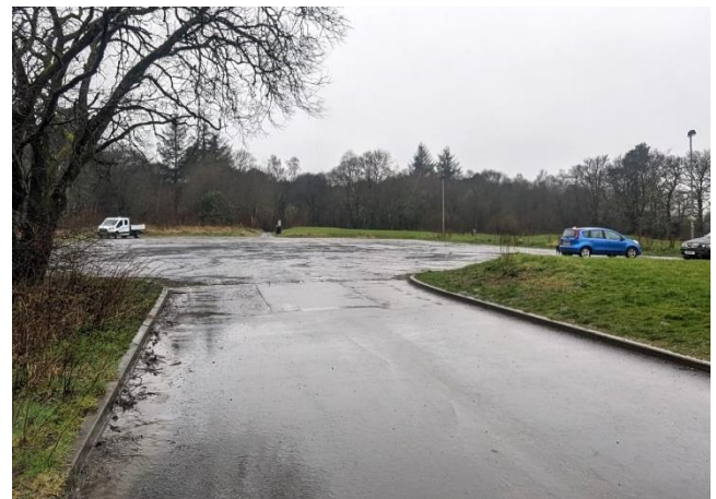
South car park