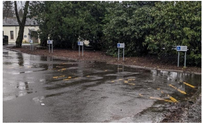
Signposted blue badge bays in Train car park