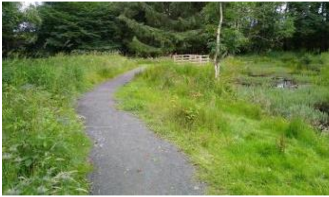
Surfaced path around the Pond on the Blue Route