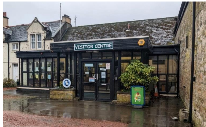
Visitor Centre/Reception entrance