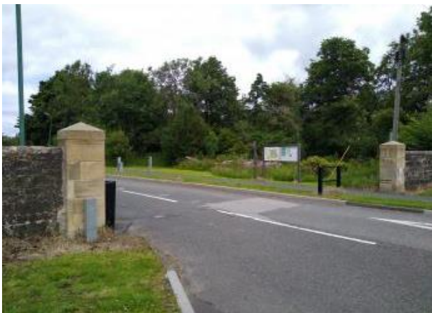
Main Entrance (and vehicle entrance) into Park