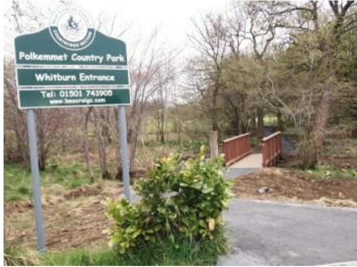
Whitburn pedestrian entrance