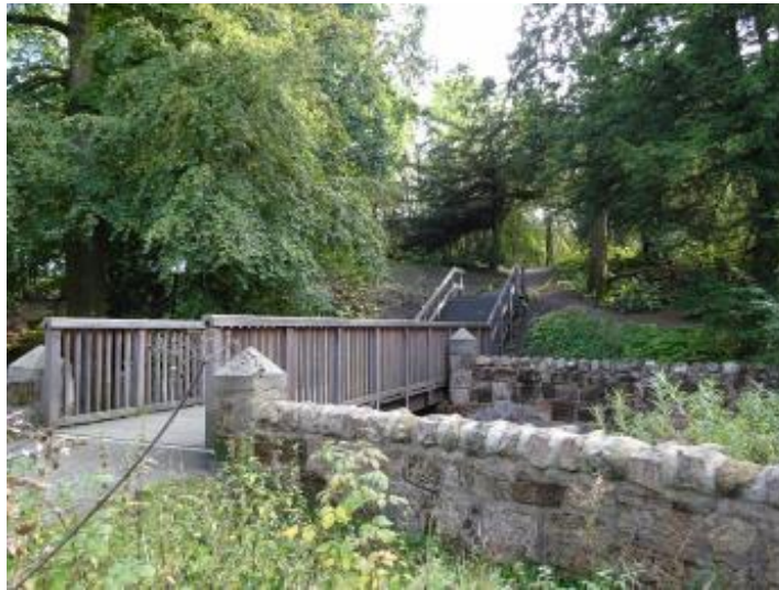
Bridge crossing along Red Route