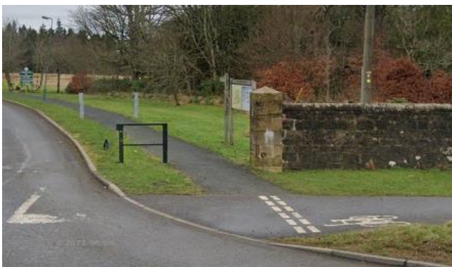
Main Entrance pedestrian path