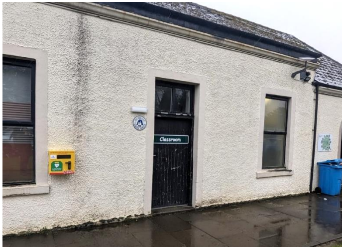
Entrance to classroom