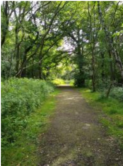
Red Route Trail