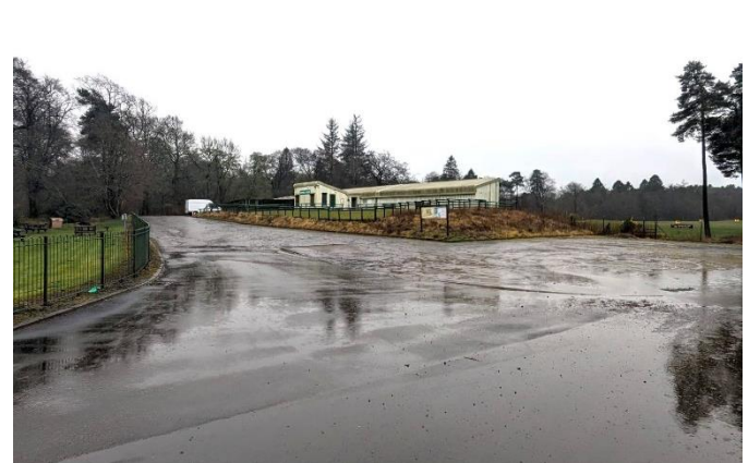
Driving Range car park