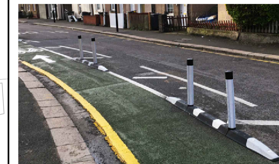
Fig 1. ORCA WAND - TO PROVIDE TRAFFIC SEGREGATION. PRODUCT 2.5m IN LENGTH & ARE BOLTED INTO CARRIAGEWAY WITH 5m GAP.