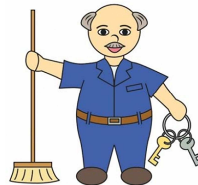
Breakdown of comments received around facilities management