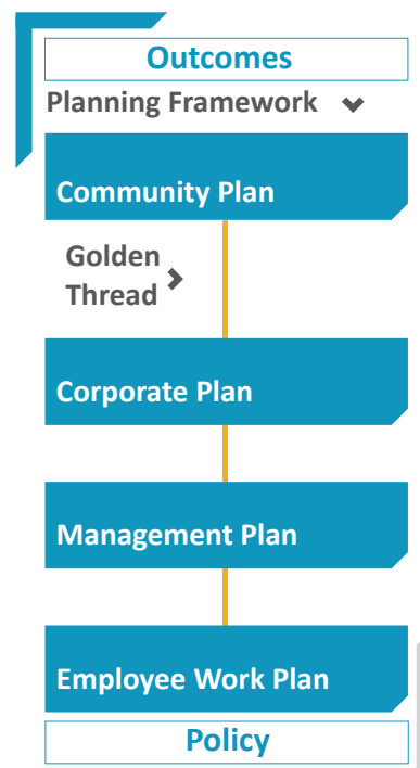
Figure 2: Planning Framework

The SOA provides the council and our partners with a shared set of priorities that must be driven down through every level of the planning framework. This link between strategic priorities and planning is referred to as a 'golden thread' and it ensures that there is a strong focus on the achievement of outcomes at every level of the council.