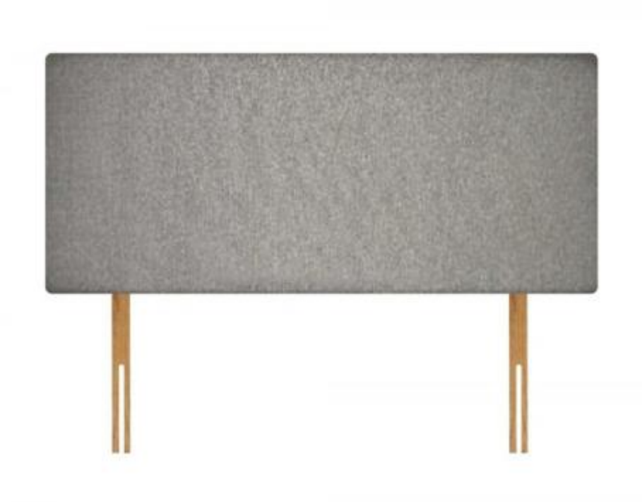
Mattress 1 item