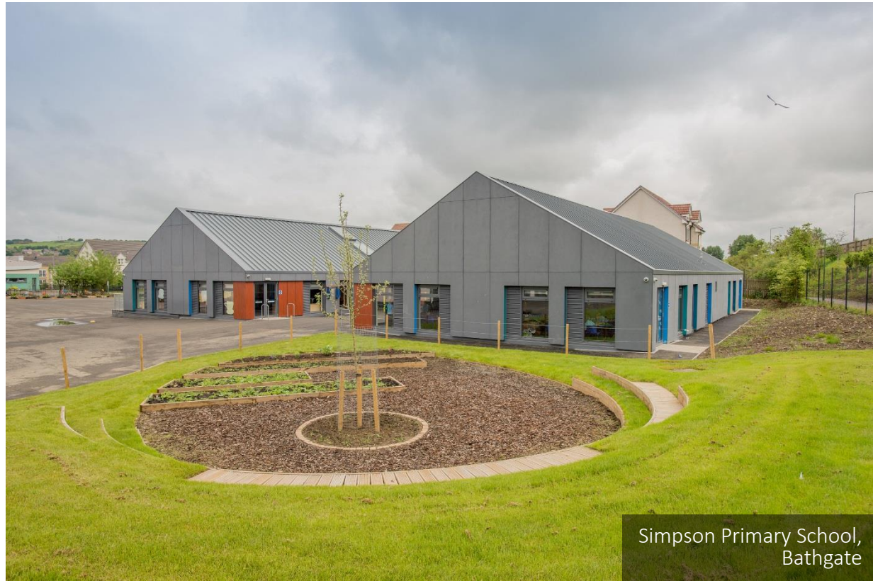
Simpson Primary School, Bathgate