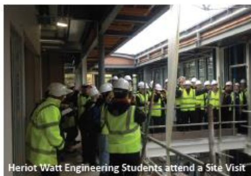
Heriot Watt Engineering Students attend a Site Visit