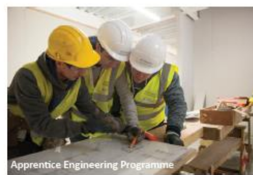
Apprentice Engineering Programme