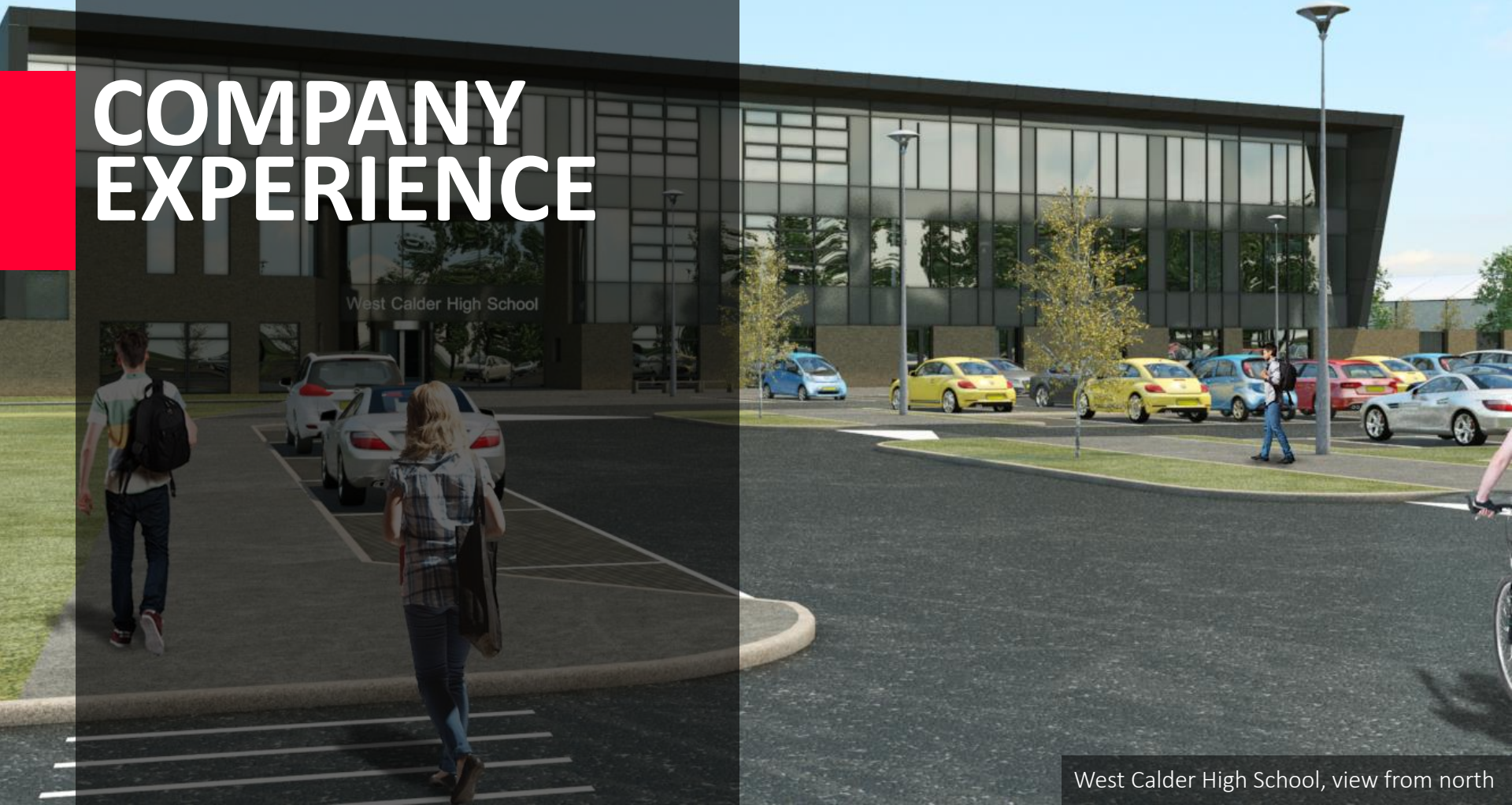
West Calder High School, view from north